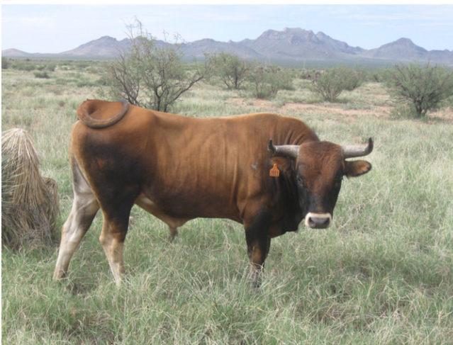
Fig. 2. Raramuri Criollo bulls raised on the Jornada Experimental Range; A bull calf younger than 1 year of age B 3-year-old bull.

steers at least 2 years of age, and 50 steers 18 months or younger. The JER steers are finished as grass-fed beef at 30 months of age as a result of their slower growth rate. Preliminary enterprise budgets prepared using production and marketing experiences from the JER 23 indicate a similar to improved level of net return with RC cattle. The advantageous fertility, longevity, and low-cost production noted for these cattle meant net economic returns were equal to what could be made from typical British breeds of the area. Net returns were increased with RC production when it was assumed that added forage could be harvested because of their favorable foraging behavior. The enterprise budget analysis recognized the extended foraging time for grass-finished production, a sale price discount for RC animals, and differences in forage demands with the small-framed animals. Future research is being proposed in collaboration with New Mexico State University Department of Animal and Range Science to further investigate calving frequency, diets, behavior, and the economics and marketing of RC cattle.